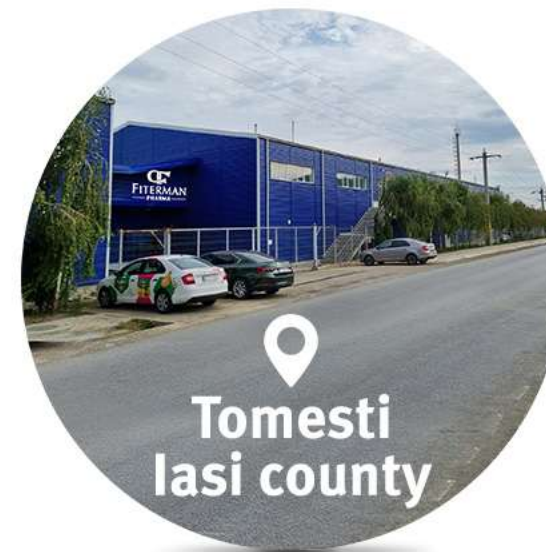
Manufacturing plant dedicated to liquid and semi-solid forms