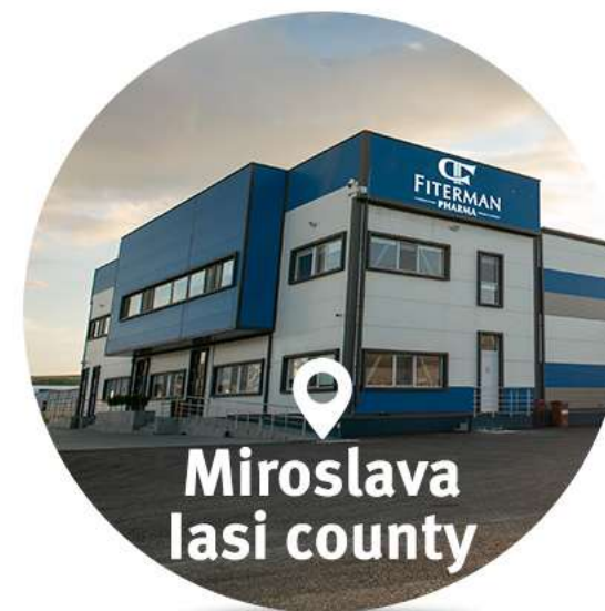
Manufacturing plant dedicated to solid forms